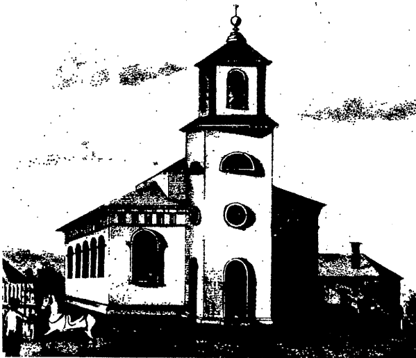
Christ Church, 1792